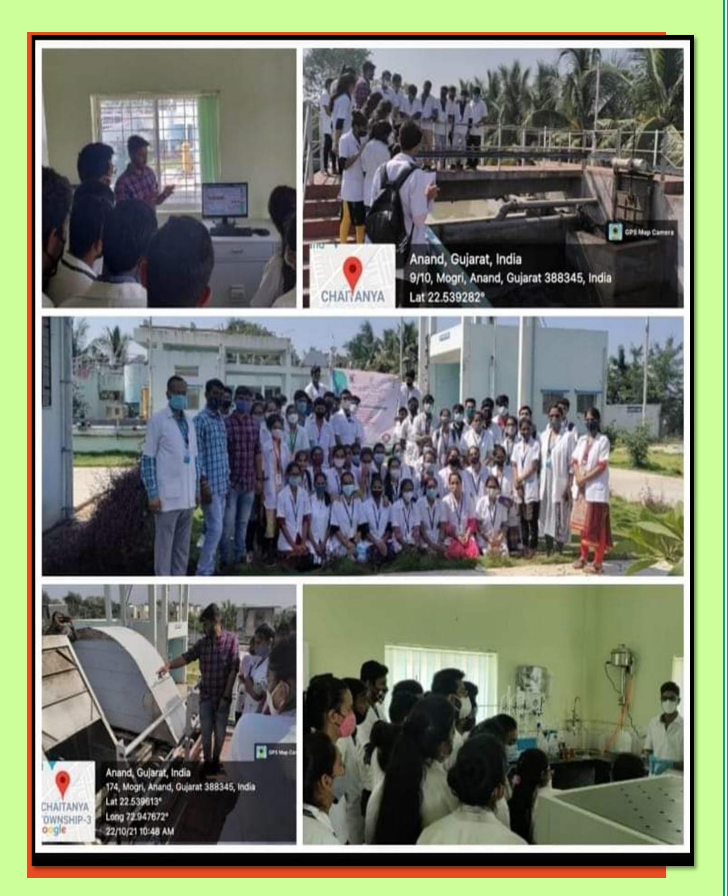
Educational Visit to Sewage Treatment Plant for Third Professional BAMS Students Organized by the Dept. of Swasthavritta